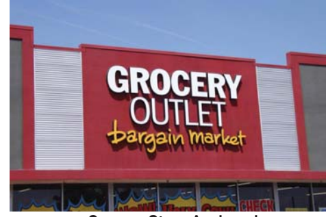
Grocery Store Anchored