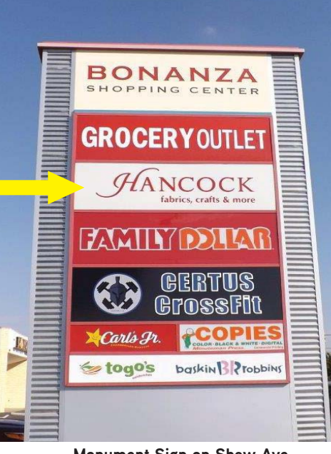
Monument Sign on Shaw Ave.